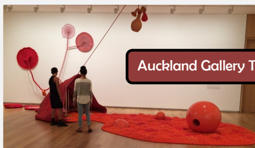
Auckland Gallery Trip