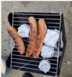
BBQ Snags & Smores