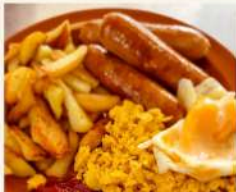
Whats in my cupboards?