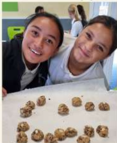
On the go - energy balls

As well as looking at food sources, students will also develop skills in silent communications (think about the movie 'Bird Box'), evacuation-ready systems, and basic first aid.